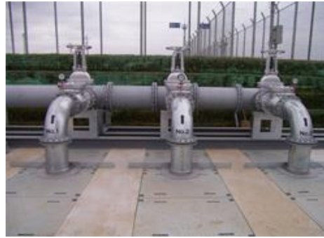
Internal polyethylene-lined steel pipe