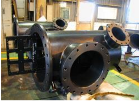
Strainer of piping for deep sea water

This type of steel pipe requires short production lead time and simultaneous treatment procedure of both external and internal linings, to ensure consistent lining characteristics.