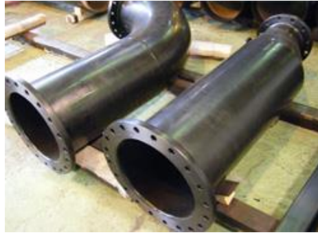
Polyethylene lined pipe with reducer