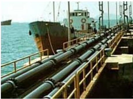
Ballast water piping