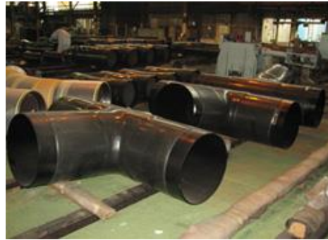
T-shaped pipe + external polyethylene