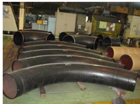
Induction pipe bend + external polyethylene lining