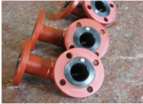
Internal polyethylene-lined steel pipe

An additional benefit is that the lining material does not produce harmful substances when burned, and therefore need not be separated from the pipe during scrapping.