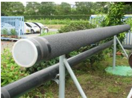
External polyethylene lined steel pipe