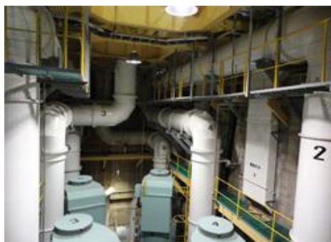
Internal polyethylene-lined steel pipes