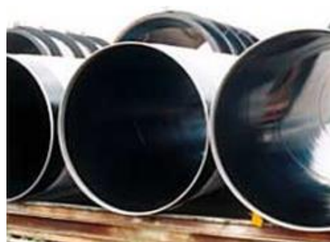
2,600φ internal polyethylene lined