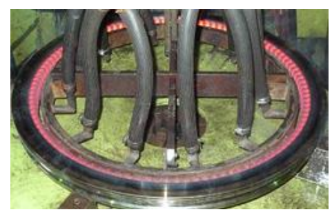
Wheel teeth quenching

Hardeness vs. depth from groove surface of lace (Material; S48C)